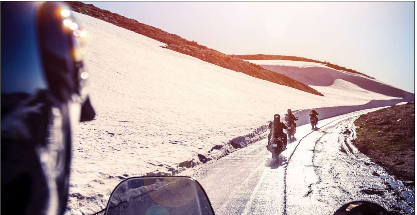
The sun's glare can still be a safety hazard throughout winter, so riders should be sure to wear sunglasses or a tinted motorcycle helmet visor during cold-winter rides.