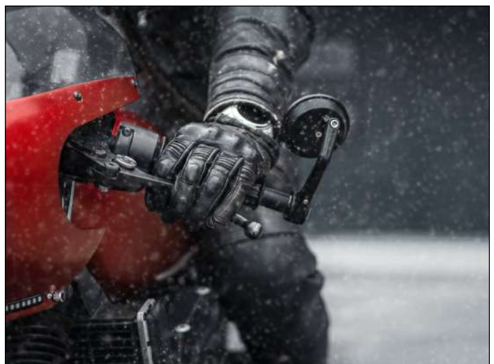
Motorcyclists who ride during the winter months should ensure they have the required cold weather gear to stay safe, warm and comfortable during rides.